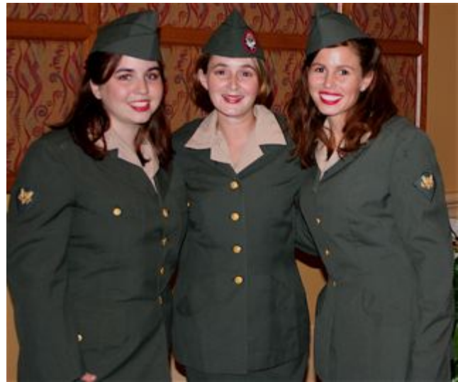
World War II USO Reenactors