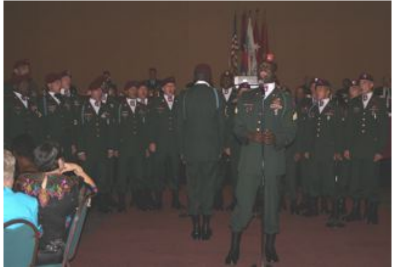
82 nd Airborne Division Chorus