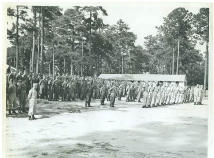
Sand Hill Formation When It Was Announced that 800 Men would be Reassigned to the 82nd