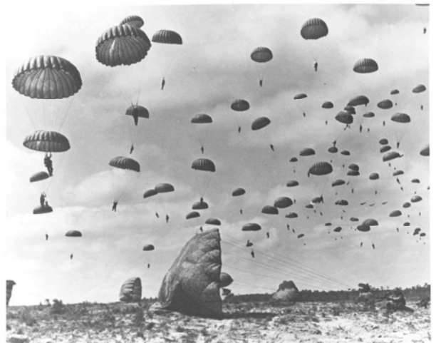
Mass Jump of T-7's at Fort Benning