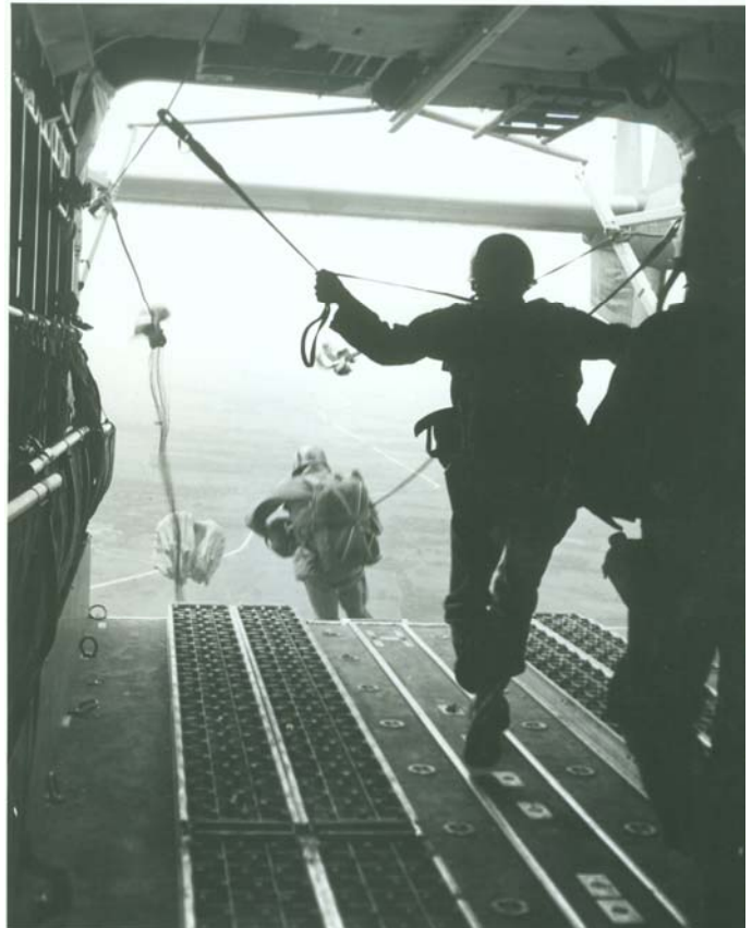
Fort Benning Jump From a Flying Boxcar with Clamshell Doors Off