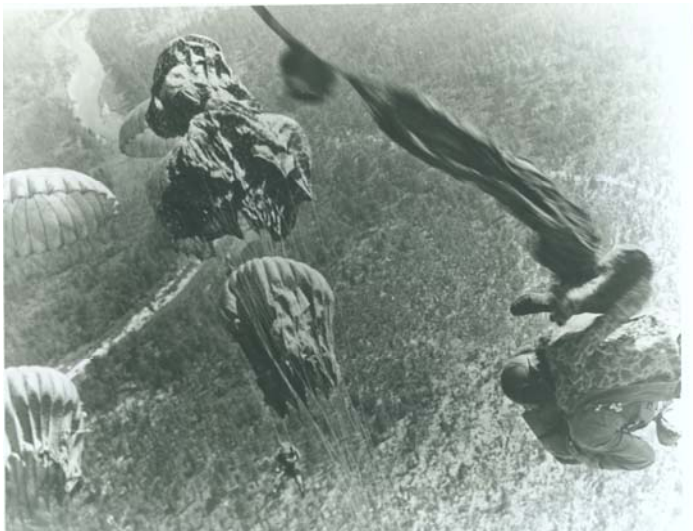
Jumping T-7's at Fort Benning