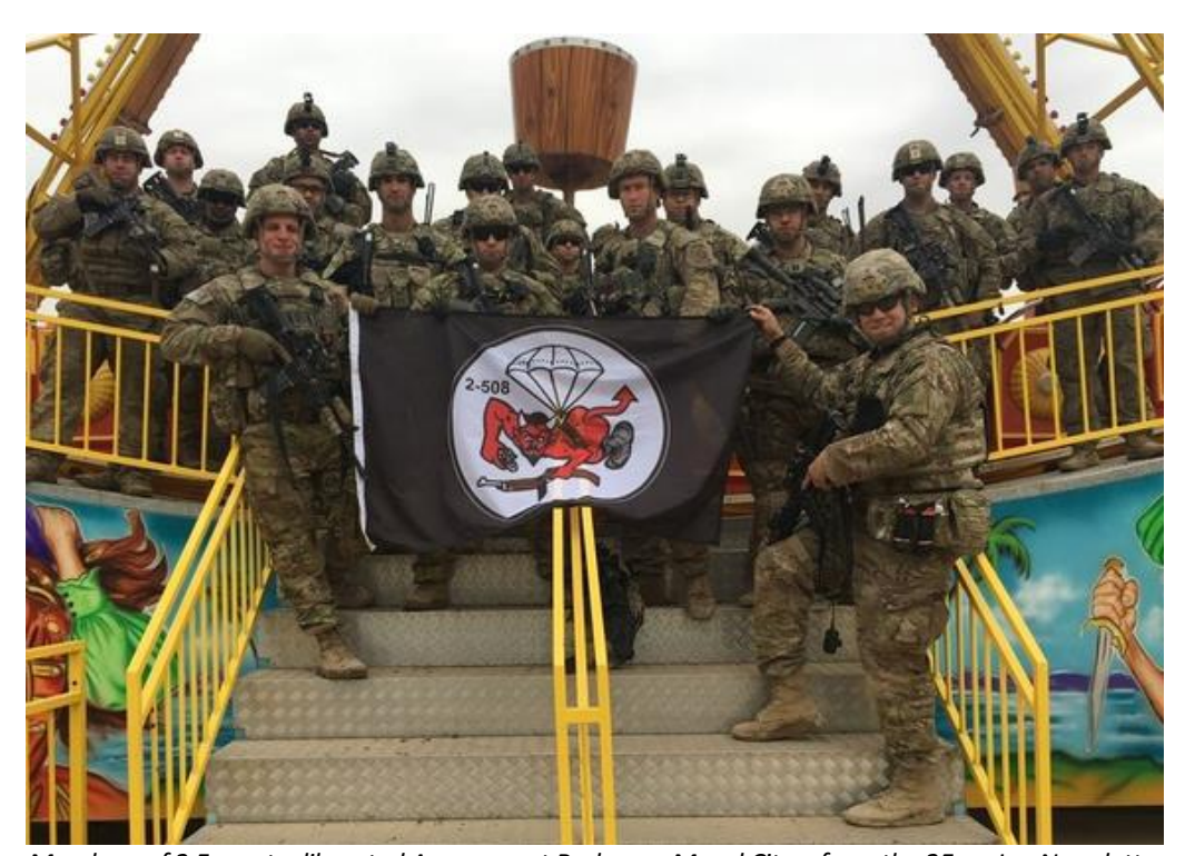
Members of 2 Fury at a liberated Amusement Park near Mosul City – from the 2Fury Jan Newsletter