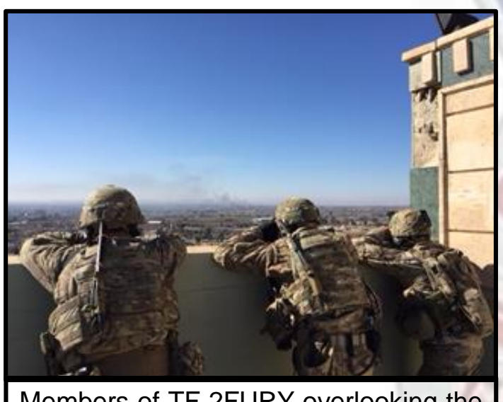
Members of TF 2FURY overlooking the city of Mosul.

TF 2Fury Paratroopers eagerly began learning their roles from their 1-502 counterparts. The Paratroopers immediately understood the importance of owning the responsibilities at TAA Filfayl and were motivated to learn from the outgoing Soldiers. These responsibilities included everything from security of the camp to planning patrols. SSG Shanahan (D Co) and SSG Balona (C Co) have done a spectacular job in ensuring security of our base camp, while 1LT Shannon (D Co) and 1LT Rabbitt (C Co) took the lead on familiarizing our troopers on our new environment to include initial introductions with the Iraqi Army at their planning Headquarters. While members of C Co and D Co were interfacing with their 101st counterparts, LTC Browning and his staff were doing the same with the 1-502 Battalion