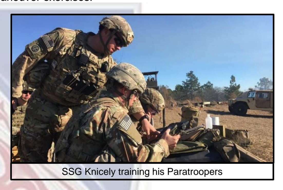
The Battalion continues to sustain Airborne readiness as these operations are a critical part of keeping our Paratroopers current and qualified to answer the Nation's call on a moment's notice.

This event allowed leaders to assess the readiness of the Platoon and qualified them to participate in live fire maneuver exercises.