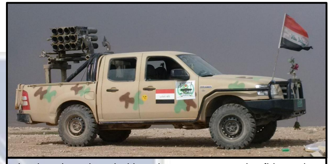
Iraqi truck equipped with rocket system staged at firing point

At the end of February, the West Mosul clearance operation was in its initial stages and TF 2Fury was charged with advising and assisting a new unit – the 9th Iraqi Army Division. Throughout the month of March, TF 2Fury met with their Iraqi counterparts on a daily basis to build trust and become integrated into the Iraqi planning cycle for the operation.